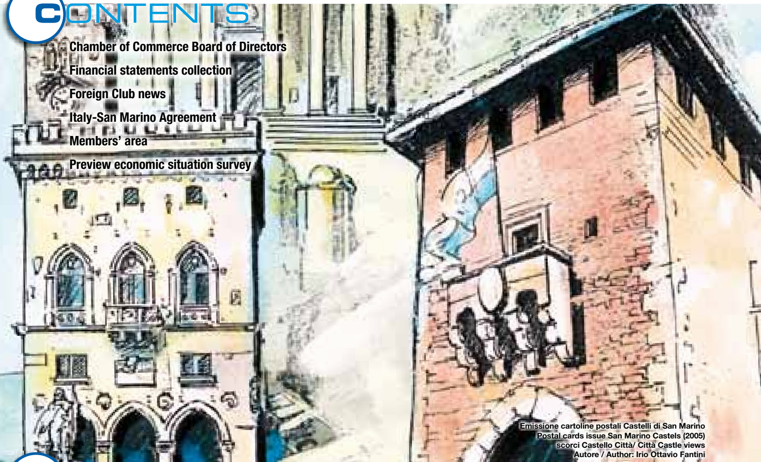
Emissione cartoline postali Castelli di San Marino Postal cards issue San Marino Castels (2005) scorci Castello Città/ Città Castle views Autore / Author: Irio Ottavio Fantini